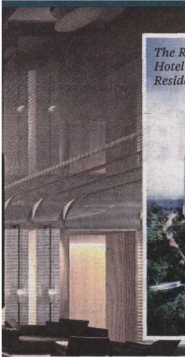
The RuMa Hotel & Residences.